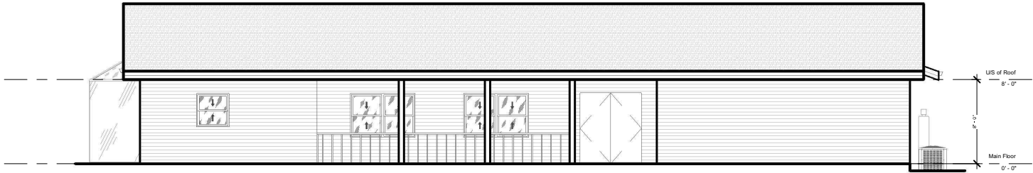
1 Front 1" = 10'-0"